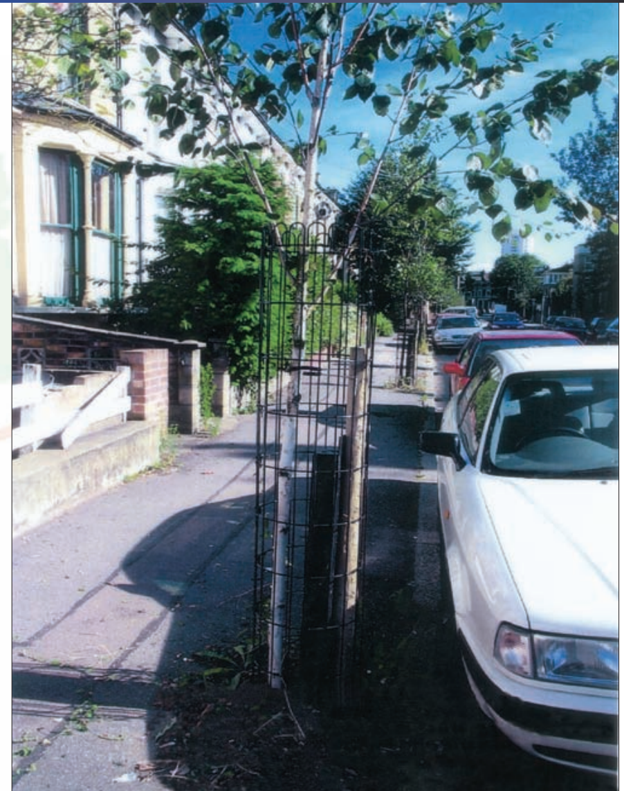
A planting in Hackney, planted in February 2004 and photographed in the summer of 2004. Arbortech planting kit type A were used comprising a tree shield, tree restraint and root drencher for watering. (see Hackney case study for project 2 years on, page 18)